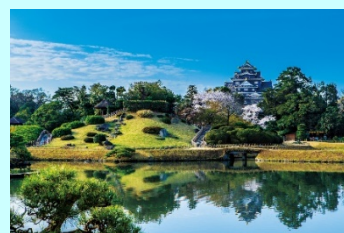
Okayama Korakuen Garden

There is no place like Okayama for sports camps and I can give you my greatest confidence in our ability to provide the best environment. We look forward to hearing from you!