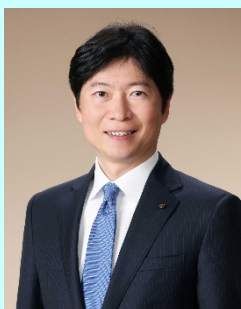
Governor of Okayama Prefecture Ryuta Ibaragi

Not only does Okayama have a low incidence of natural disasters, in all of Japan, it has the most days where rainfall is less than 1 mm, earning it the name "Hare no Kuni", or "the Land of Sunshine".